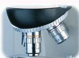
Reversed nosepiece with plan achromatic objectives