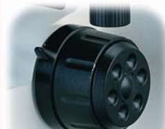
Modern coarse/fine focus with tension adjustment and limit stopper