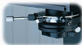
Rack & Pinion Abbe condenser with diaphragm