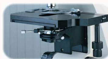
Smooth, coaxial control mechanical stage with slide holder